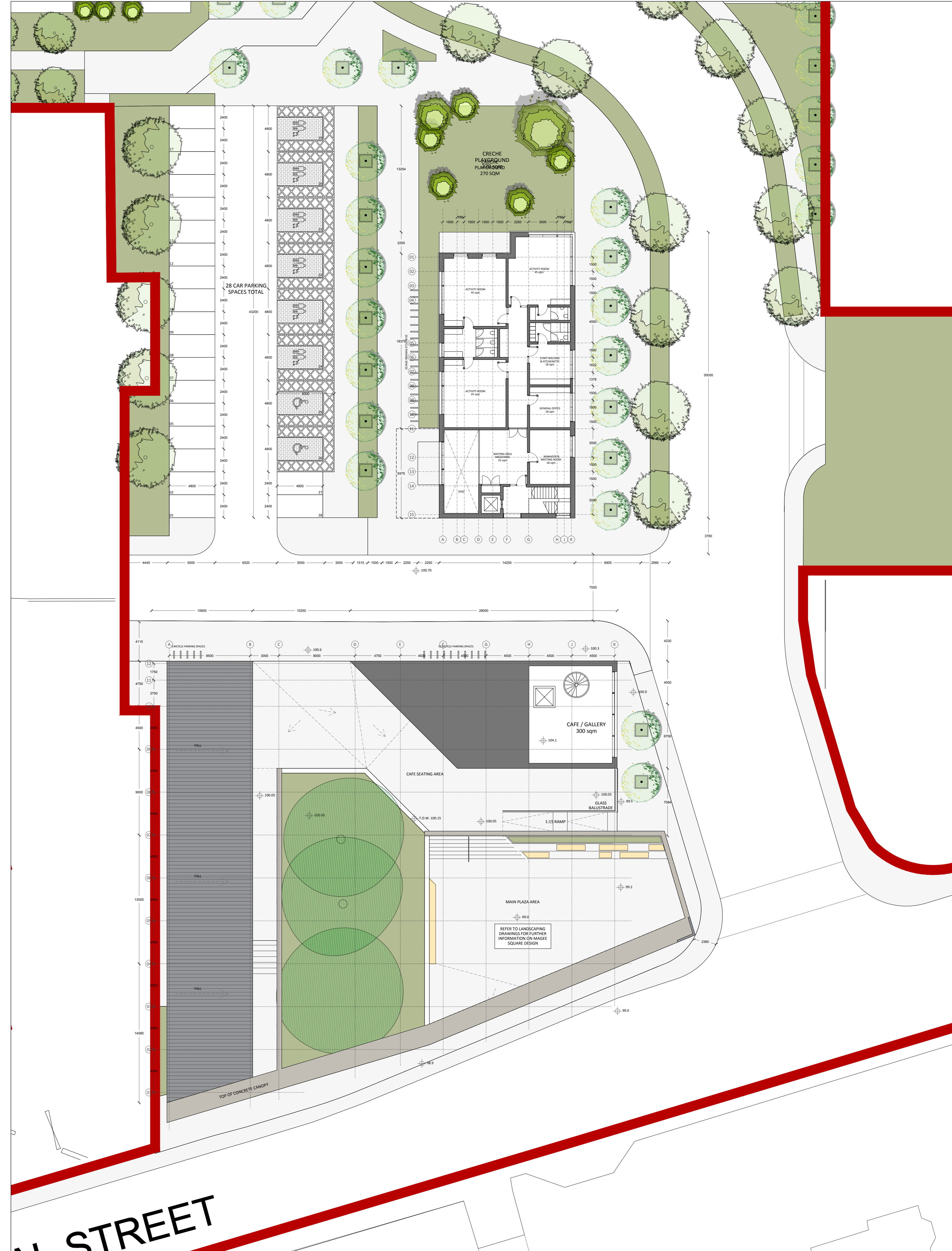
FIRST FLOOR PLAN NEIGHBOURHOOD CENTRE + CRECHE